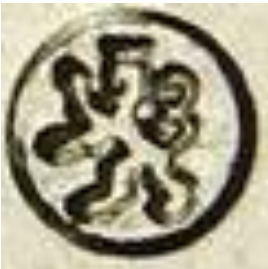
Logo of the Mint of Finland.