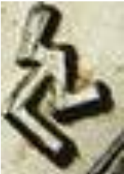
Initials of the designer Georgios Stamatopoulos.